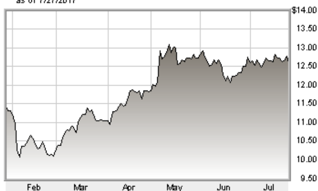
CALLAWAY GOLF CO as of 7/27/2017