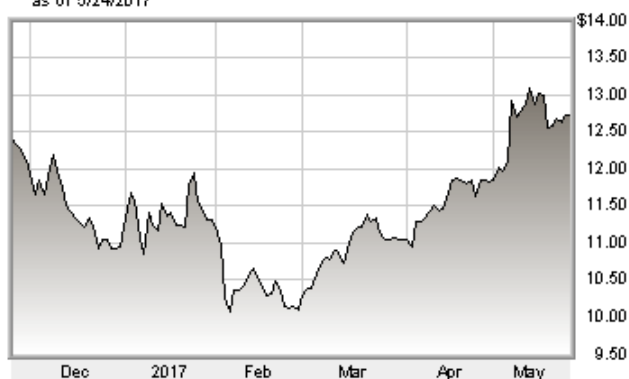
CALLAWAY GOLF CO as of 5/24/2017